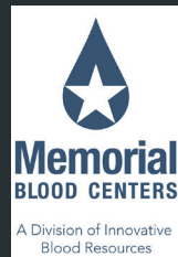
Memorial Blood Centers